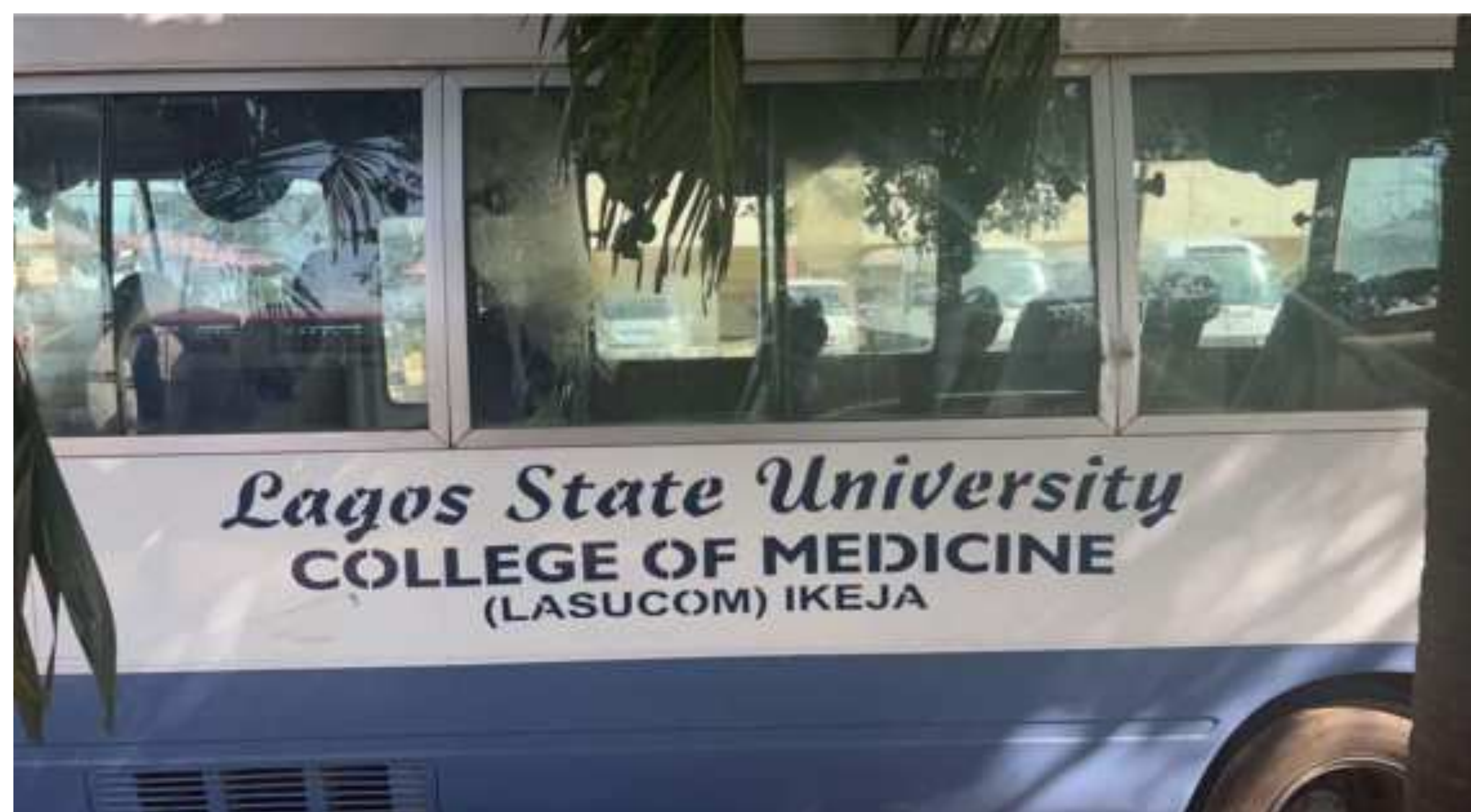
Data took place at Lagos State University Teaching Hospital