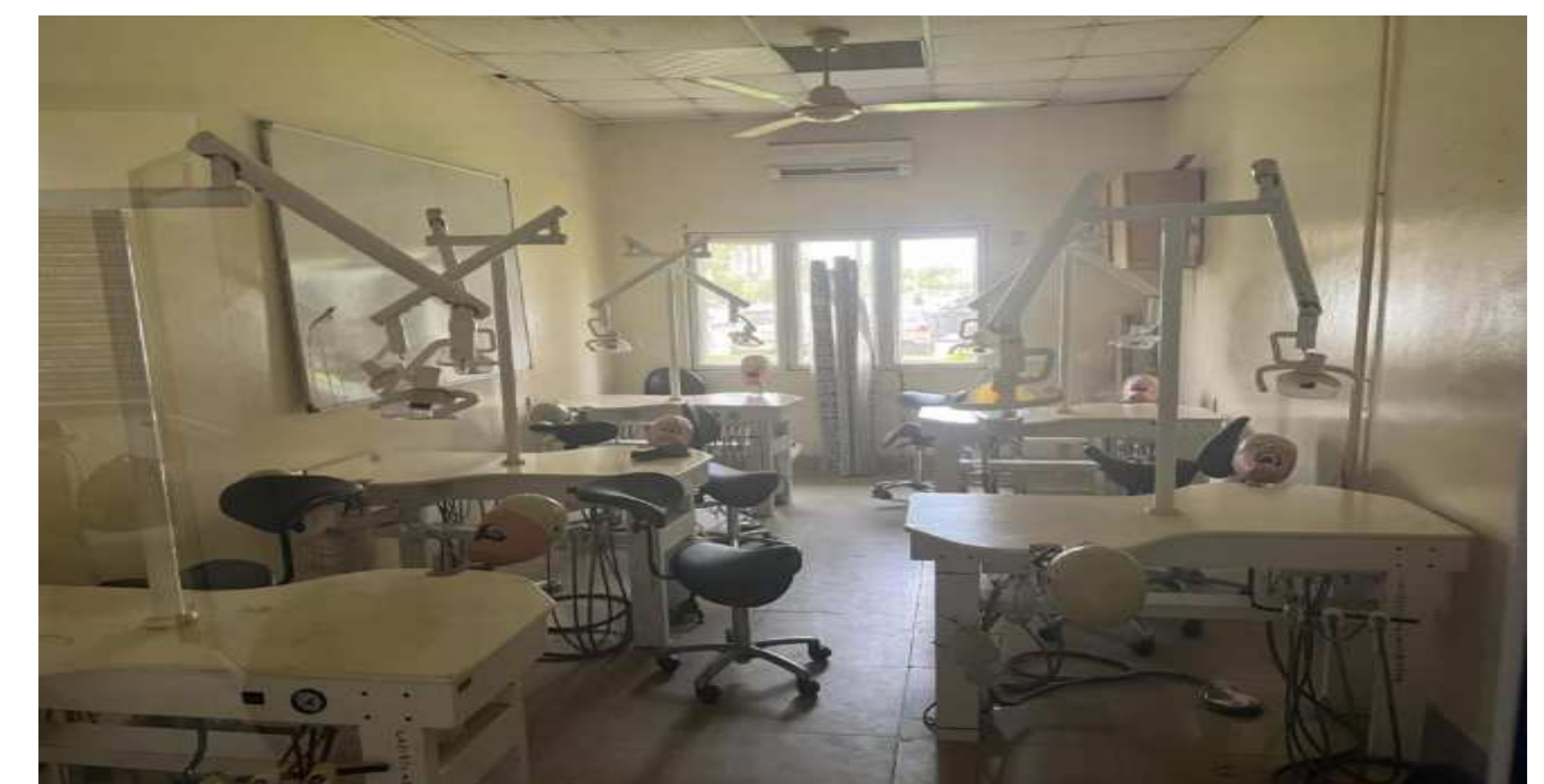
Practice room for dental students at Lagos State University Teaching Hospital

Thanks to each study participant, our fieldwork assistants, the College of Arts and Sciences at Vanderbilt University, The evolutionary studies initiative (ESI) at Vanderbilt and the National Science Foundation.