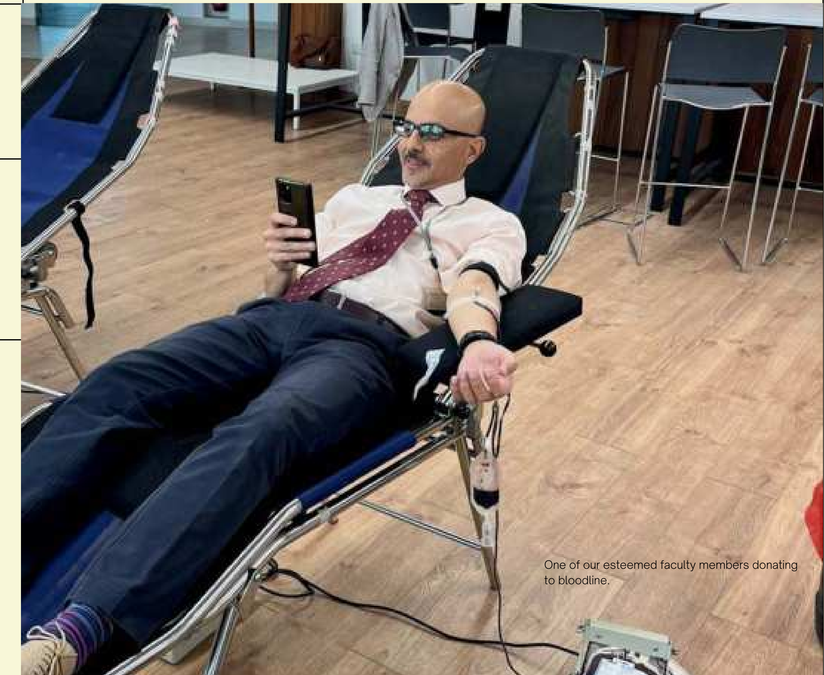
One of our esteemed faculty members donating to bloodline.

Due to scarcity of resources, it is becoming more and more difficult to help all the patients in need. Therefore, in these changing times. We can only help the patients with a fraction of the actual prescription cost as we are getting a bigger patient load.