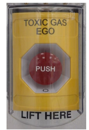
Figure 6 Emergency Gas Off (EGO) Push-Button