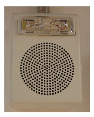
Figure 1 ESB Fire Alarm Light & Horn Combination

In all cases actuation of the ESB fire alarm system will result