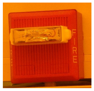
Figure 2 Solvent Fume Hood Fire Alarm Light & Horn Combination

directly above the solvent hood, manual actuation pull-station and two CO<sub>2</sub> cylinders. When a UVIR sensor detects a flame inside a hood, a white strobe and audible alarm are actuated and two CO<sub>2</sub> cylinders are automatically released into the hood. For a localized solvent hood fire alarm actuation (i.e. fire entirely contained inside a stainless-steel solvent hood), <u>a</u> <u>general ESB fire alarm will be actuated and occupants shall</u> <u>immediately exit the building without stopping to remove their</u> <u>cleanroom garments and assemble on the second/ground floor</u> <u>of the 25<sup>th</sup> Avenue parking garage.</u>