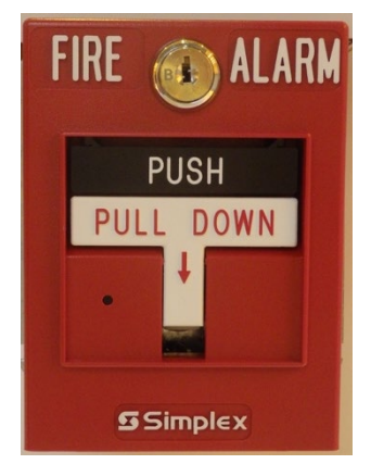
Figure 5 Typical Fire Alarm Pull-Station

Yellow Emergency Gas Off (EGO) stations are located near the exits from the cleanroom. They should be actuated when it becomes apparent that an uncontrolled process gas leak is in progress or has the potential to be initiated such as a mechanical accident shearing off gas piping that would result in uncontrolled gas release. NOTE: The EGO stations isolate toxic/corrosive and flammable gases that are distributed from