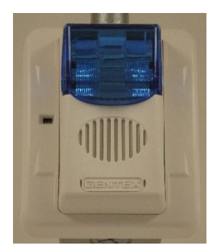
Figure 3 TGMS Alarm Light & Horn Combination

The TGMS alarm system is made up of a blue flashing light and horn. Unless instructed otherwise by VINSE cleanroom staff, exit the cleanroom immediately if the TGMS blue light starts flashing with or without the horn and wait for further instructions in either the Gown or Pre-Gown room. If the general ESB fire alarm system actuates, exit the building immediately and assemble on the second/ground floor of the 25<sup>th</sup> Avenue parking garage.